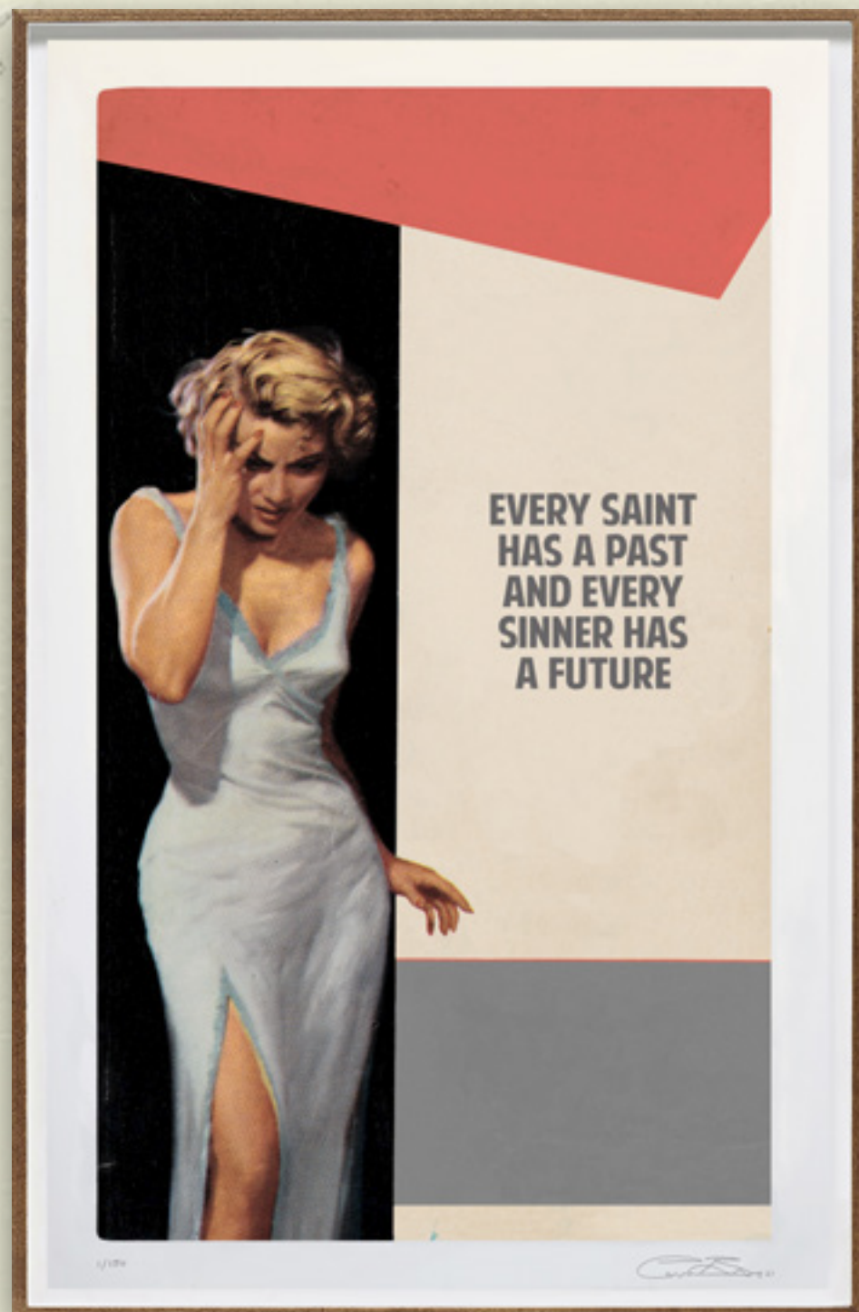
EVERY SAINT HAS A PAST Limited Edition with Silkscreen Varnish, Edition of 150, Size: 30 x 47", £1,650