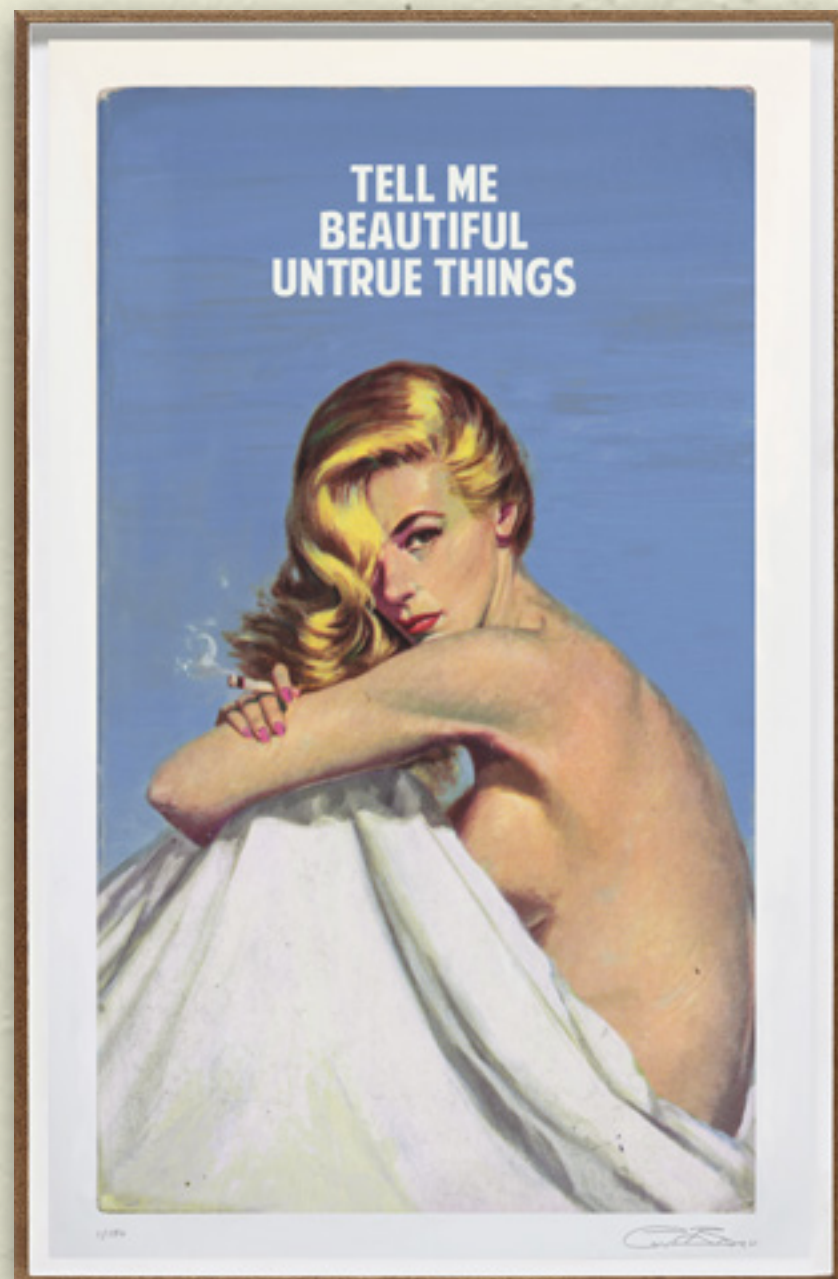
TELL ME BEAUTIFUL Limited Edition with Silkscreen Varnish, Edition of 150, Size: 30 x 47", £1,650